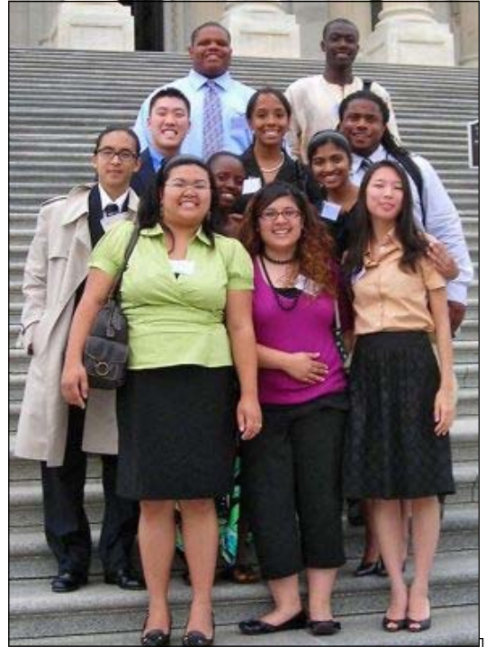
Ethnic Young Adult Interns gather on the steps of the U.S. Capitol in Washington. The interns, sponsored by the United Methodist Board of Church and Society, spent this summer living together while working in organizations that address social concerns. The young people, ages 18 to 22, represent African, African-American, Indian-American, Hispanic/Latino and Asian-American heritages.

Look for profiles of these various missions and funds in the next several epistles.