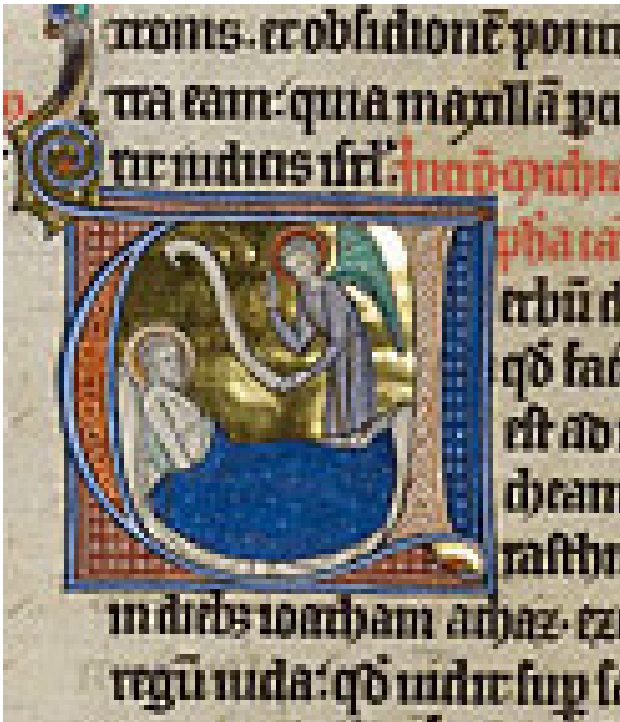
An Angel Before Micah Franco-Flemish, 1270